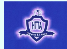
TABLE TENNIS FEDERATION OF INDIA